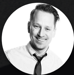
PE COATING SYSTEMS GRAHAM AUDENART